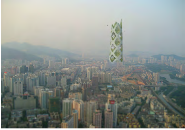
Shenzhen Logistic City, PRC