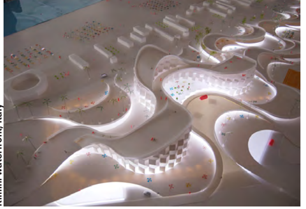
Rimini waterfront, Italy