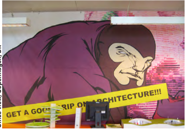
Office view, Copenhagen, DK