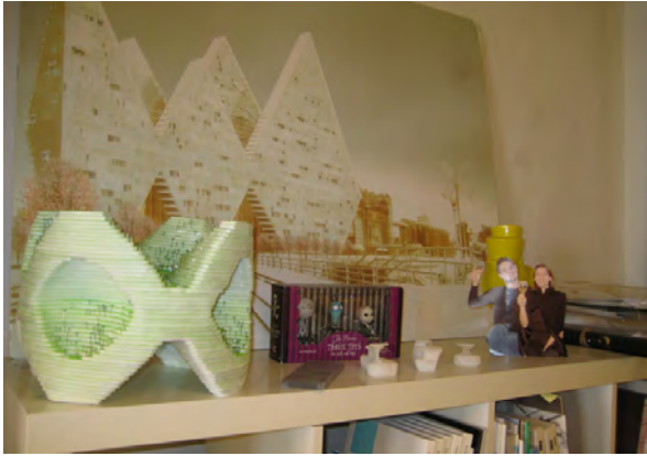
Office view, Copenhagen, DK