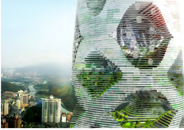
Shenzhen Logistic City, PRC