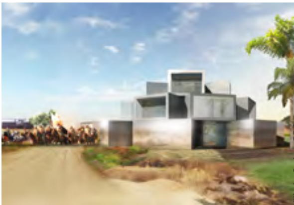
Villa in Ordos, PRC