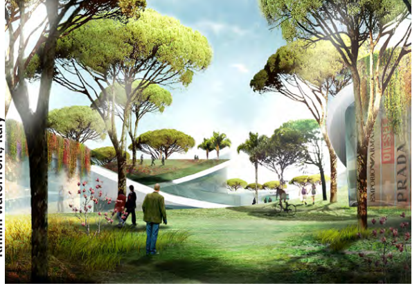
Rimini waterfront, Italy