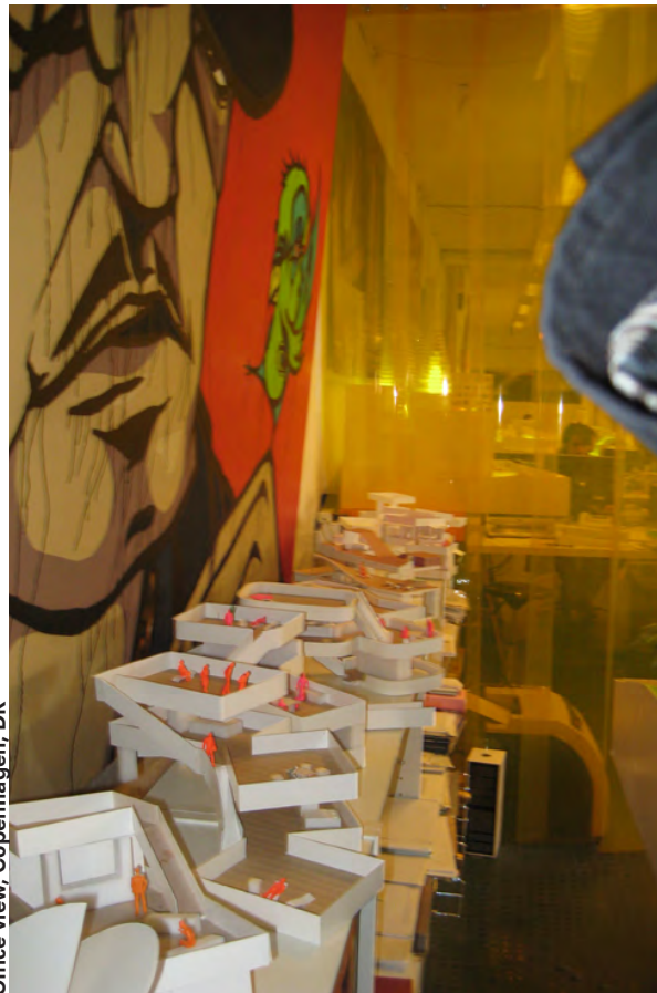
Office view, Copenhagen, DK