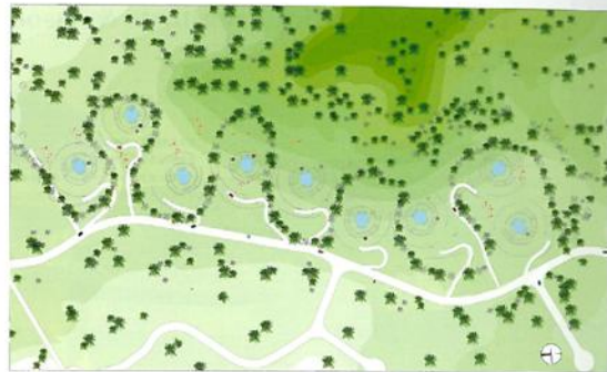
Site plan (scale: 1/2,500) / 敷地計画 (縮尺: 1/2,500)

102-103頁：敷地のランドスケープと同化した住居の様子。表紙、上：中庭から見た屋根の連続。裏紙、下：中庭から見た庭園の様子。本誌、中右：コンセプトのイメージ。