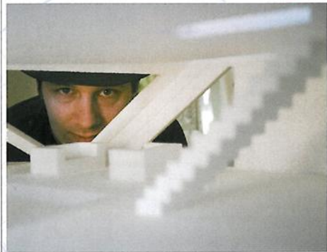
Top: Gonzalo Pacheco Images: IDS Architects, Nikky Valdes

They founded their firm, called Plot, in 2001 and parted ways in 2006 to concentrate on their own projects – but not before they had designed acclaimed schemes such as the Copenhagen