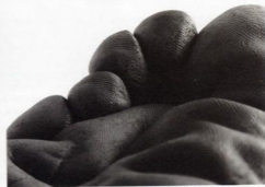
Above :: Nikolaj Moller Relationship between micro and macro landscapes from the skin to an actual building