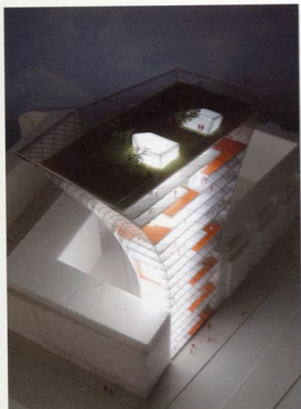
Above :: Alexanderplatz Tower Renderings of exterior