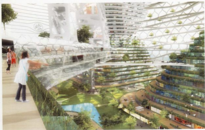
Above :: The Shenzhen Tower, China Renderings of interior and initial paper model